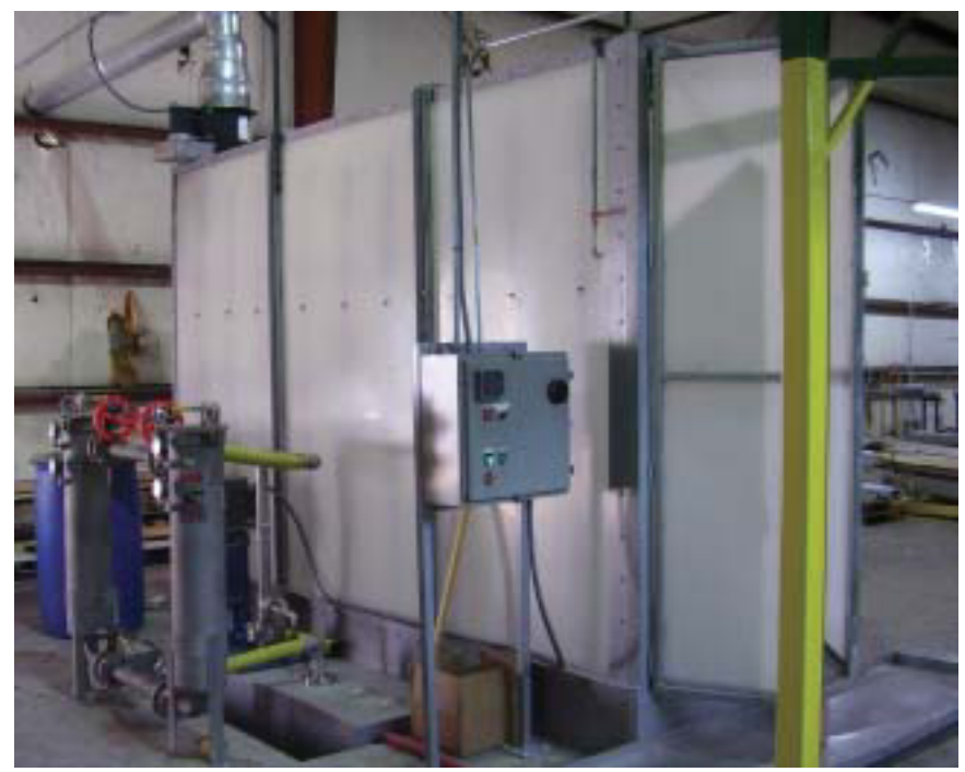
Figure 3: Small, efficient batch spray washer: parts are pretreated and dripped off on manual or automatic cycle.

is the dip tank is designed for batch operation.